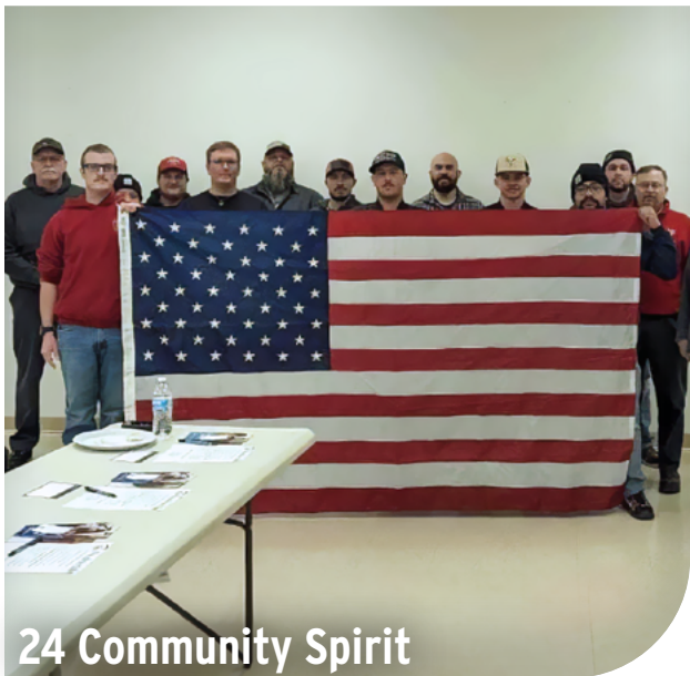
24 Community Spirit