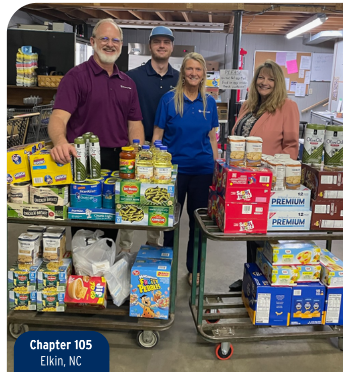
Chapter 105 Elkin, NC