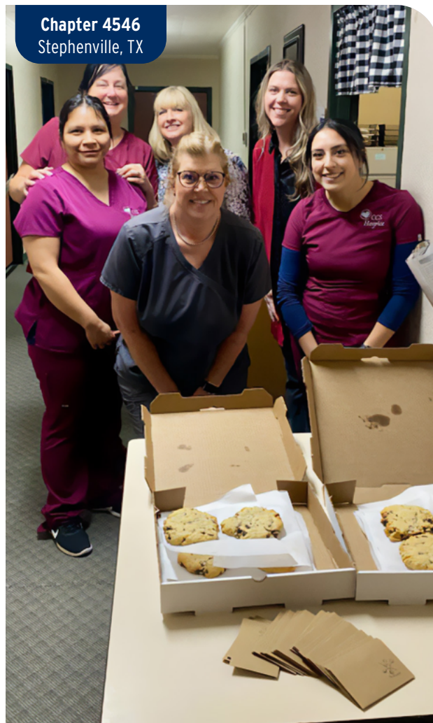
Members of Chapter 4546 in Stephenville, TX, showed their appreciation for nurses by giving baked goods and cards to hospice nurses at a local care facility.