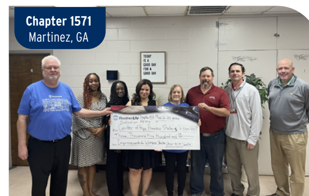
Chapter 1571 in Martinez, GA, donated $3,500 to the Salvation Army Center of Hope for improvements to the women's shelter.