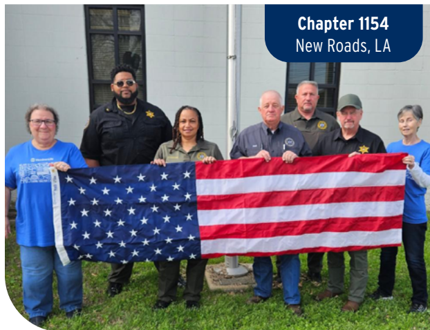
Chapter 1154 New Roads, LA