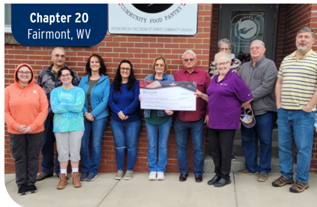
Chapter 20 in Fairmont, WV, presented a donation to The Giver's Hand Community Food Pantry in Monongah, WV. Members also distributed 184 boxes of food to local families in need.