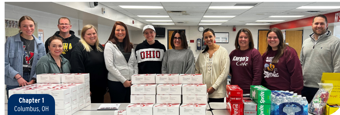
To show their appreciation for teachers, members of Chapter 1 in Columbus, OH, purchased lunch for 45 teachers and staff at Licking Valley Middle School. They also donated two new coffee makers and a supply of coffee pods, soft drinks, water, and snacks for the teachers' lounge.