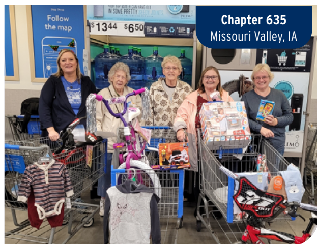
Chapter 635 in Missouri Valley, IA, partnered with West Central Community Action and VFW Ladies Auxiliary to adopt two families. Together, they purchased clothing, bicycles and toys for the families.