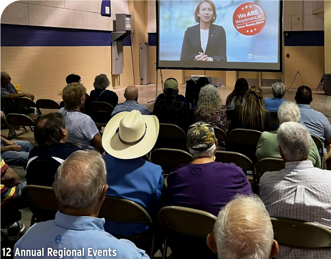
12 Annual Regional Events