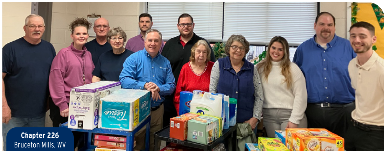
Chapter 226 Bruceton Mills, WV

Chapter 1154 in New Roads, LA, presented an American flag to the Pointe Coupee Parish Sheriff's Office Communications Division.