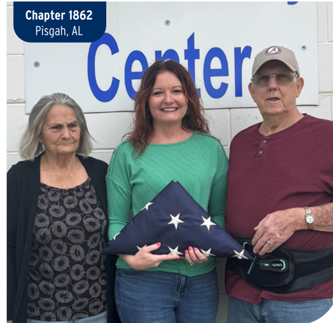
Chapter 1862 Pisgah, AL

West Virginia Chapter 226 donated snacks, cleaning supplies and puzzles to a local special education class.