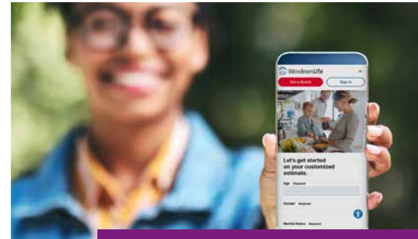
Visit WoodmenLife.org/Calculator then schedule your annual review with your WoodmenLife Representative.

The calculator is a helpful resource if you're looking to purchase life insurance for the first time or if you're interested in buying additional coverage. After all, life changes and