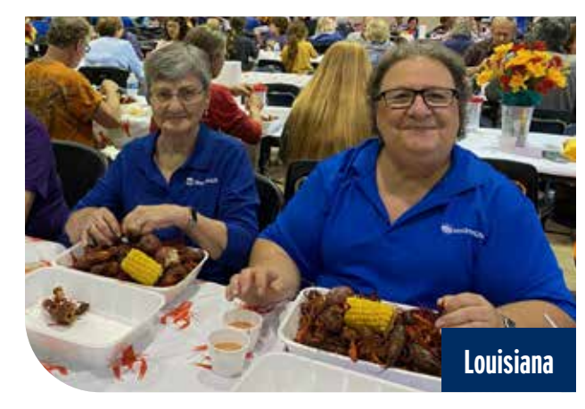
In Louisiana, ARE attendees wrapped up a fun and productive day with a crawfish boil and live music