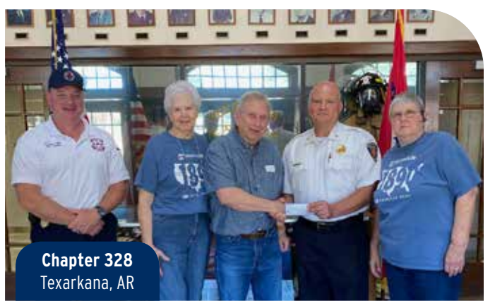
Chapter 328 in Texarkana, AR, made a $400 donation to the National Fire Safety Council. Members also delivered a barbecue meal to the Texarkana Fire Department in appreciation for all they do.