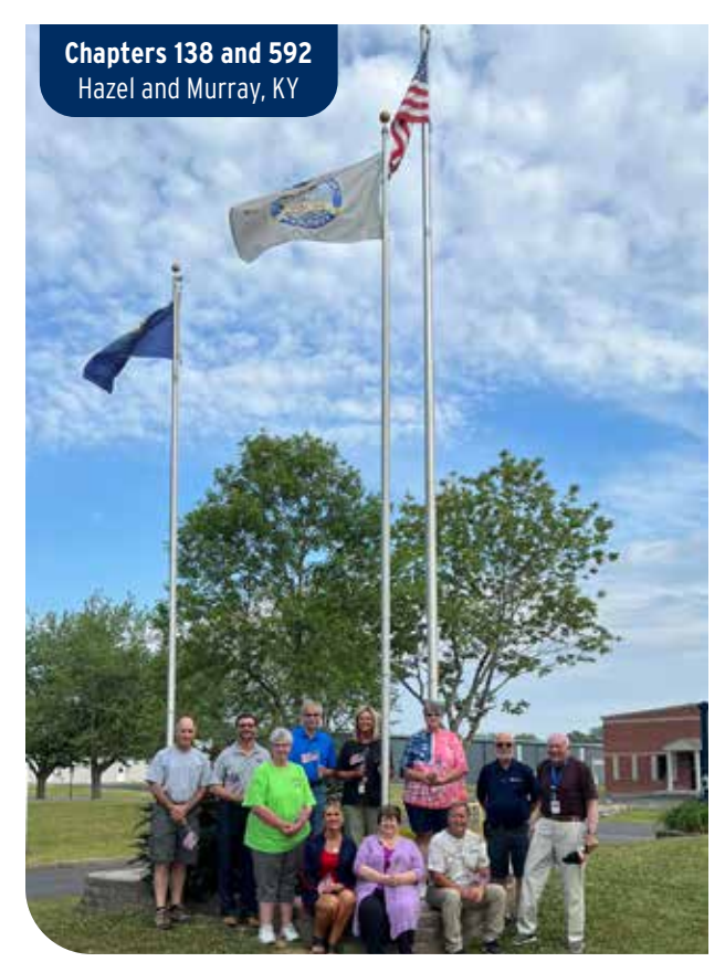
Kentucky Chapters 138 and 592 worked with local government officials to purchase and erect flagpoles and flags at the entrance of a community park. The project was put on hold for two years during the pandemic, but the final result was worth the wait.