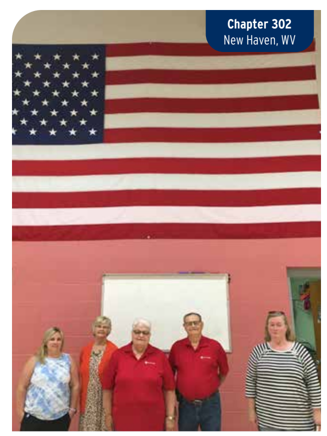
Officers of Chapter 302 in New Haven, WV, presented Ashton Elementary School with a flag to be displayed in its gymnasium.