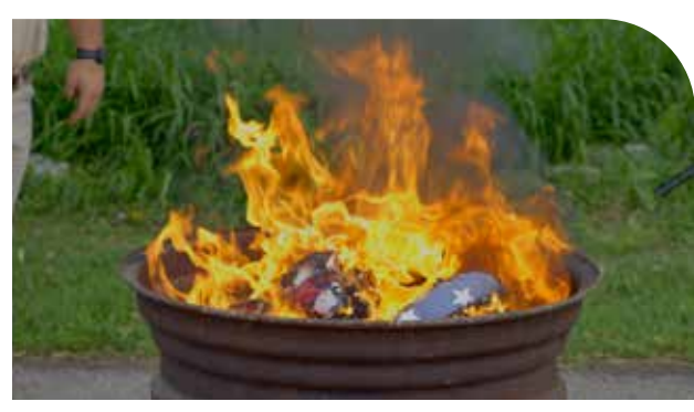
Scouts with Pack 114 in Fort Calhoun, NE, demonstrate the proper way to retire an American flag that's become old, worn, frayed, or faded.