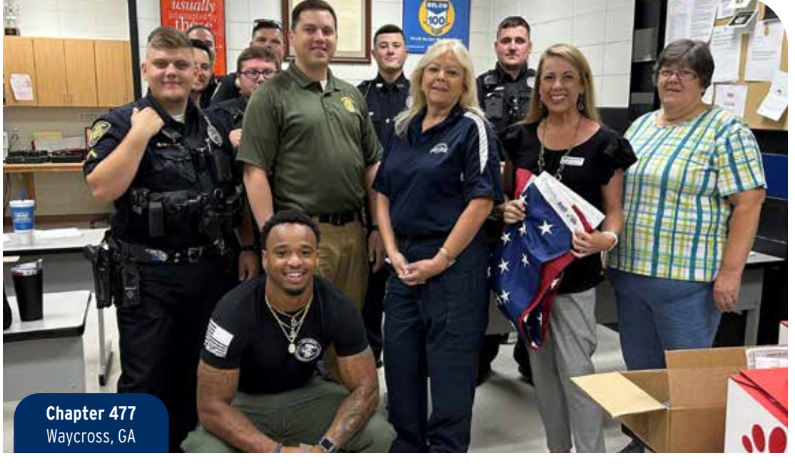
Members of Chapter 477 delivered coffee and breakfast from Chick-fil-A to officers with the Waycross Police Department.