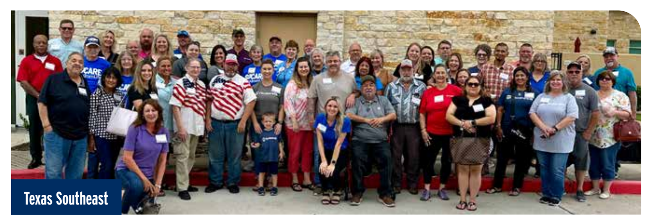
It was a full house for the Texas Southeast ARE. Among the highlights were a special service project benefiting DAV, a nonprofit that provides support for Veterans, and later a trip to Typhoon Texas Waterpark.