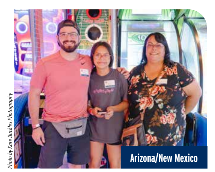
The Arizona/New Mexico ARE was held at Main Event, which allowed the business part of the event to smoothly transition into the entertainment. Attendees enjoyed a barbecue lunch and all-you-can-play activities.